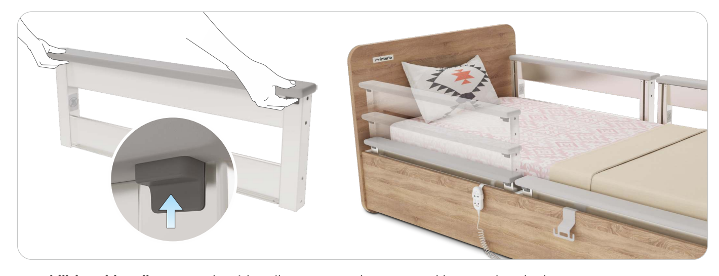
Mobilising side rail system: The side rail system can be operated by pressing the buttons present at the end of each side rail. This must be operated using both hands.

The lying surface comprises of removable PP injection moulded parts that are easy to clean and maintain over the years. Split in four sections, back rest, pelvic, upper leg rest and lower leg rest, the bed is designed for utmost patient comfort and helps prevents excessive pressure during sitting up positions.