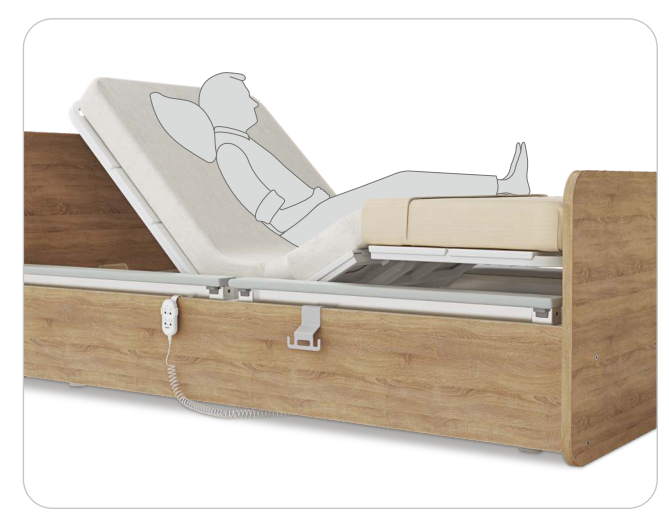
DVT position: Electronically adjustable back rest and leg rest; DVT position available.