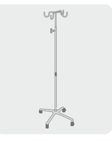
Saline Stand 4-hook height adjustable MS Saline Stand with 4 castors.