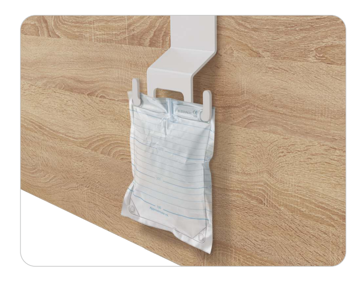
Urine bag holder: Separate attachment hooks onto PLT; either on left or right.