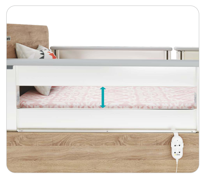
100 mm gap between edges of siderails for visibility, and to avoid claustrophobic feeling in the patient.