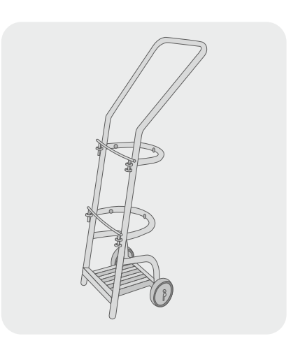
Oxygen Cylinder Trolley Supports mobile respirator with spontaneous breathing mode