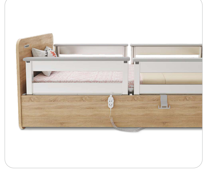
Full length split telescopic side rail for protection, to prevent falls.