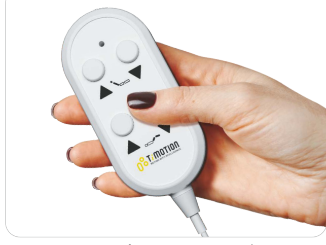
Remote Control: Easy to use, two buttons for up & down function of backrest and leg rest.