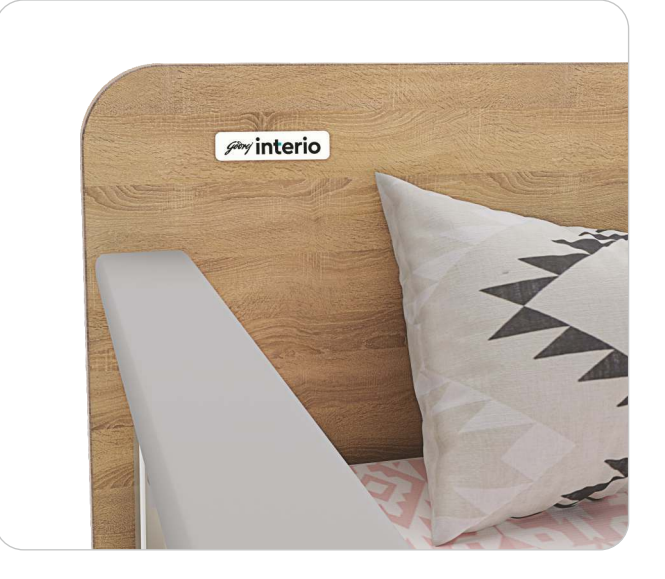
Rounded corners to prevent injury.