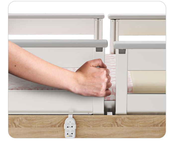
Entrapment safe ergonomic design.

Grace Homecare Bed is a feature-loaded bed, designed to make homecare safe and convenient for the patient and caregiver.