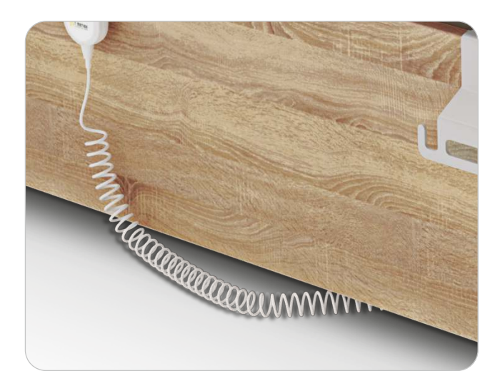
Spiral wire: Minimises entanglement, keeps area neat.